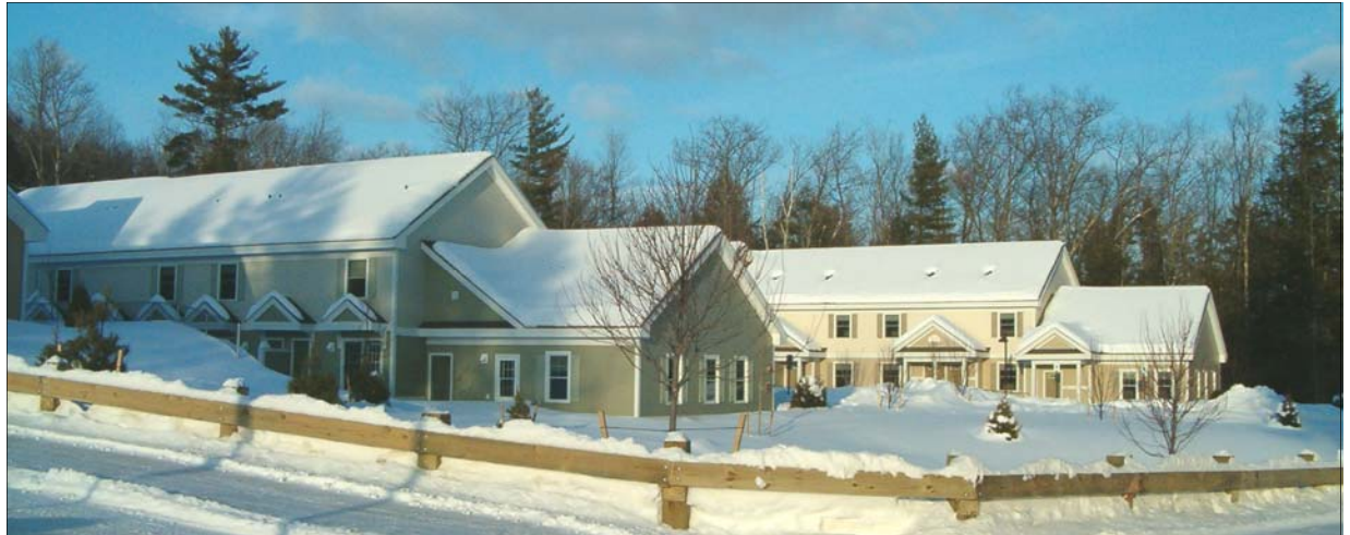
Lochmere Meadows Apartments, Tilton

The Land Trust was recently awarded the Lakes Region Chamber of Commerce's Golden Hammer Award for Lochmere Meadows Apartments in Tilton. The award was presented at the Chamber's annual meeting and awards luncheon held at Church Landing on January 27th. The Golden Hammer Award recognizes excellence in new construction.