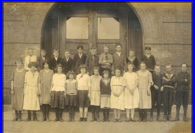
Picture taken at the Mechanic Street School in 1943