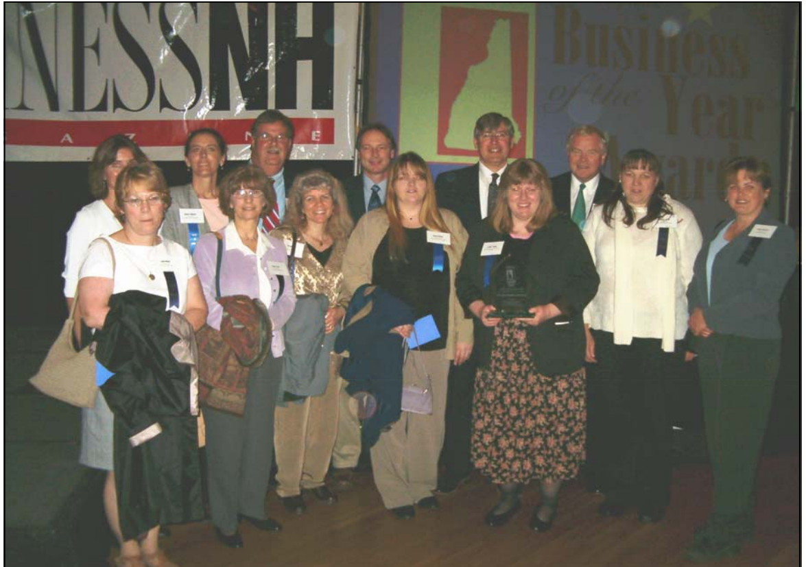
LACLT Staff & Board at Business of the Year Luncheon