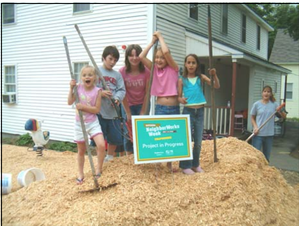
"KIDS CREW" 1st Place Prize Winning Photo

LACLT recently celebrated National NeighborWorks® Week by hosting a playground cleanup and beautification project at our Avery Hill Development. A group of volunteers, including LACLT residents, staff, Youth Services Bureau participants, and other friends put down 22 yards of wood chips in the playground, cleaned the playground equipment, filled the sandbox, constructed a fence between the parking lot and the playground, landscaped the entrance and the embankment, planted flower planters and flower gardens, trimmed trees and bushes, seeded the lawn