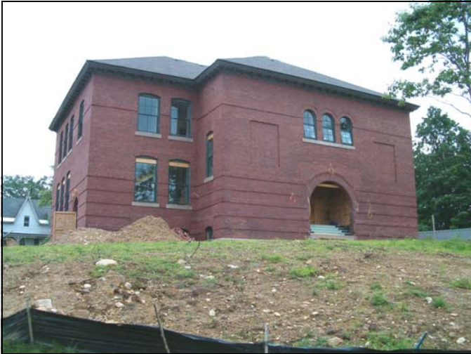
Mechanic Street School

We are four months into construction at the former Mechanic Street School in Lakeport. This 1.3 million dollar adaptive reuse project will create six new permanently affordable one and two-bedroom apartments. These apartments will be rented to families with earnings between 50% and 60% of area median income. The building's interior has been gutted. New interior partitions are up. The building has been insulated, and rough plumbing and electrical work have been completed. Sheetrock is now being hung, and interior painting has been scheduled for later this month. The damaged slate roof has been replaced with slate-look shingles. The windows have been replaced with historically accurate vinyl replacement windows for energy efficiency. We anticipate construction will be completed by September 30th and the units will be fully occupied shortly thereafter.