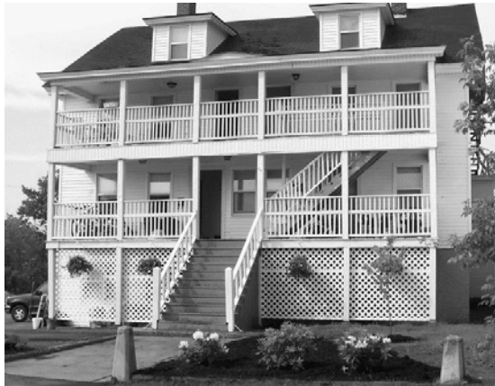
Transitional Housing Building Located at 85 Elm Street Laconia

Over the course of the past several months, structural repairs were made to our Elm Street Transitional Housing Building. In order to make the repairs, families living in the building were moved into our permanent housing. While the units were unoccupied, we took the opportunity to make a number of capital repairs. These included repairing and repainting the front porches, replacing flooring and appliances, and repainting the apartments.