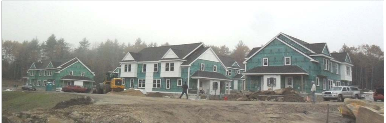
Harriman Hill Apartments located off Route 109A in Wolfeboro - 24 permanently affordable 1, 2, and 3 bedroom apartments

Construction is nearing completion for Phase 1 of Harriman Hill in Wolfeboro, a 3-phase workforce housing development. 12 units will be ready for occupancy in January. The remaining 12 units in Phase 1 will be ready in early Spring. Located off Pine Hill Road (Rt. 109A) behind the former Harriman Construction Company, this 35-acre site met the Wolfeboro Master Plan goals of village infill, access to public utilities, and close proximity to services and employment. It is located ½ mile from Wolfeboro Falls and 1 mile from downtown Wolfeboro.